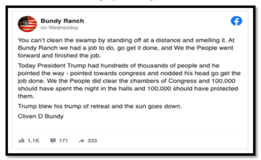
[High Country News, 01/08/21]

Cliven Bundy Posted A Message In Support Of The January 6 <sup>th</sup> Violence On Facebook, Remarking, "You Can't Clean The Swamp By Standing Off At A Distance And Smelling It."