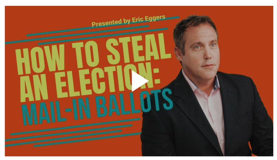
[PragerU, accessed 02/22/22]